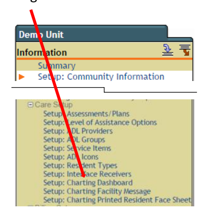
Step 3. Drag and drop any modules within the Dashboard for the desired layout. If there is a module that is not desired, drag it to the not used box. The Dashboard will automically resize when a module is not used.